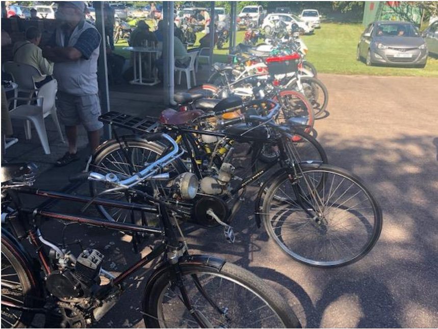
Some Pics of last month's Tiddler Entrants