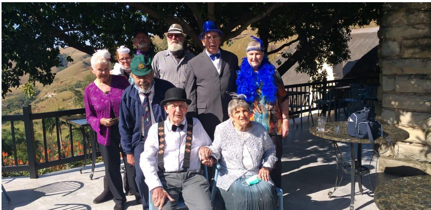
The Crew at Drakensville commemorating the DGR