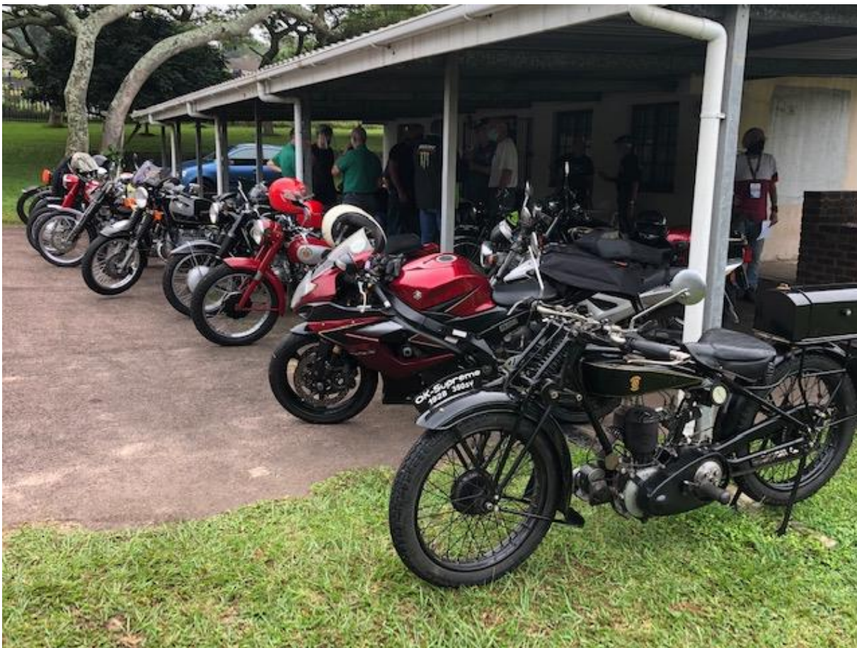
Bikes at the Club before departure